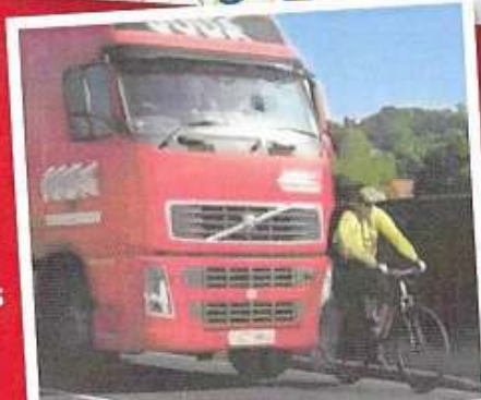
Construction traffic will severely impact the safety of Guild Wheel users!